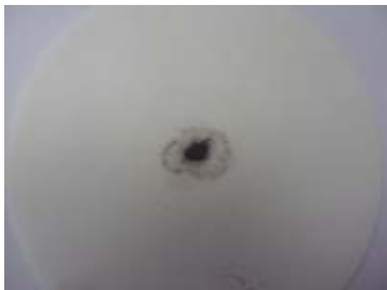
Fig. 3 Chromatograph of the soot.

Filter paper chromatography was used to verify the presence of soot as the black-bodied particles. A portion of the sample was placed on filter paper, and then was eluted with toluene to reveal the true color. The chromatogram showed finely divided material seen at the center of the sample, and surrounding black color indicating soot.