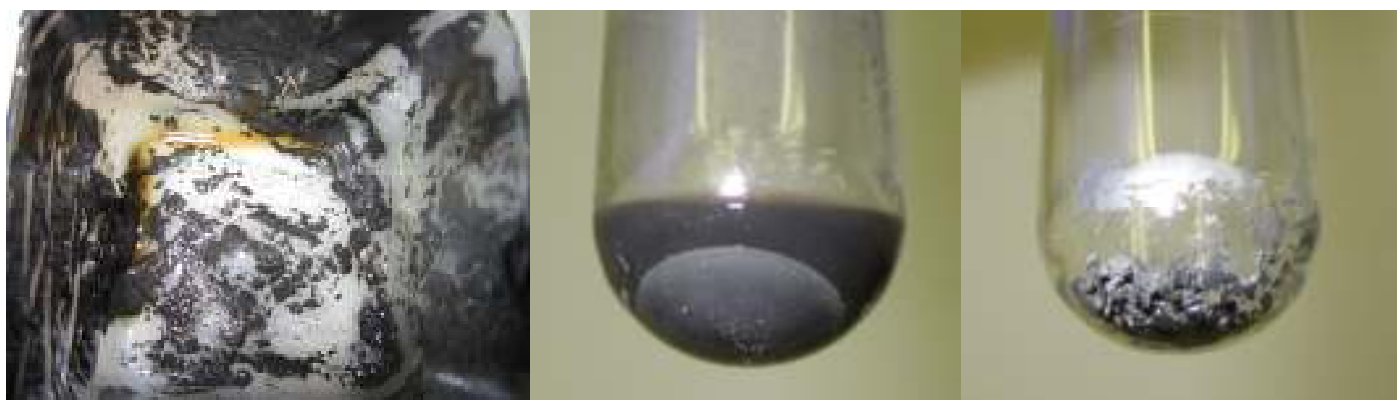
Fig. 1 (From left to right) sample as received, soluble and insoluble fraction, insoluble fraction.

The sample was washed with pentane and extracted in methylene chloride to produce two fractions: methylene chloride soluble and methylene chloride insoluble.